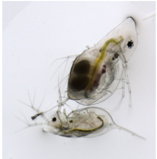
Picture: male and female Daphnia carrying a resting egg